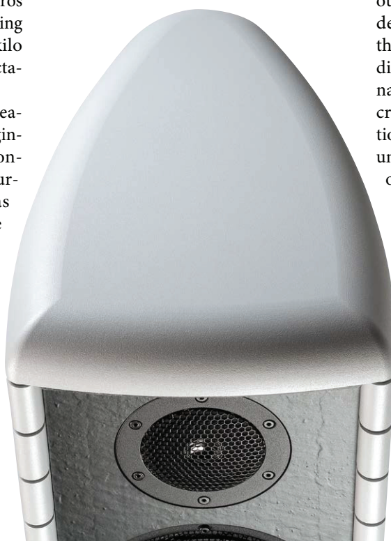
◀ The multifaceted, extremely rigid and low-resonance cabinet of the DARC 100 is also pleasing from above.

As virtually no oscillation-energy migrates into the cabinet, the speaker has a particularly precise take on natural dynamics. Already at low volumes, even the finest level differences are audible, and previously barely perceptible details are rendered exceptionally clear-cut. Should there be something like cabinet-related distortions, they were apparently eliminated entirely. These hardly measurable crossover- or chassis-associated distortions make you want to turn up the volume, as the speaker never softens the bass or annoys in the midrange and treble. More examples of the exquisite ingredients contributing to the speaker's qualities are the 20-millimeter tweeter driver with diamond-diaphragm, costing an extra 4000 euros per unit, compared to the ceramic version, and the custom-built ceramic drivers. A specially damped 17mm chassis is responsible for the midrange. Thanks to the neodymium magnet