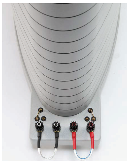
▲ The slim base features the WBT Next-Gen-connectors and adaptation bridges for bass and treble.

even more so with closed eyes. They appear to only spread the energy of the sound events they radiate. When the just mentioned bells are ringing, they can be clearly assigned to their tonal origin, while still distributing their energy over the heads of the listener and throughout the room. The Gauder succeeds in combining perceivability with power in the middle range and detailing, each on a qualitative level that is spectacular and outstanding even in the respective individual disciplines. A fusion of these qualities into one was a new and extremely enjoyable experience. The impressions with the Australian rock seniors led to the first listening day having been largely spent cavorting in the area of classic rock – from Deep Purple to Led Zeppelin and Queen. At first, we did not even get the idea of seriously looking for classic audiophile qualities, because many of the songs that had been familiar for decades could be seen (heard) under a completely new light and some entirely new aspects were uncovered in them. Bass guitar riffs, whose existence could previously only be followed fragmentary, now showed constant presence, and technical subtleties of the strumming were reproduced without any effort at all.